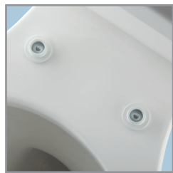
EASY REMOVAL OF SEAT FOR THOROUGH CLEANING