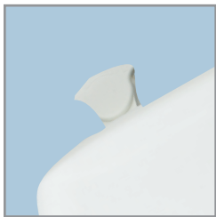
PLASTIC WHISPER•CLOSE® WITH EASY•CLEAN & CHANGE® HINGES