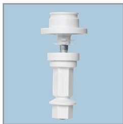
STA-TITE® SEAT FASTENING SYSTEM™